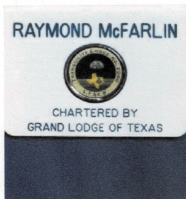
TL2K Name Badge