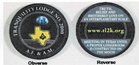
TL2K Ceramic Coin

The products and pricing of this form supersedes any prior list or social media posting prior to this date. Rev.03/2023